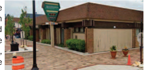
The Village of Algonquin recently acquired the former Algonquin State Bank property on Main Street and is currently seeking proposals for redevelopment.

The Village is seeking proposals for redevelopment of the property located at the southeast corner of South Main Street and Washington Street (former Algonquin State Bank). The Downtown Planning Study and Comprehensive Plan have identified this site for mixed-use redevelopment serving the Old Town Algonquin area. The preferred development should enhance the character of the Village's Main Street, increase the tax base, and compliment the new and existing development in the downtown while supporting the various community events and activities that take place on Main Street.