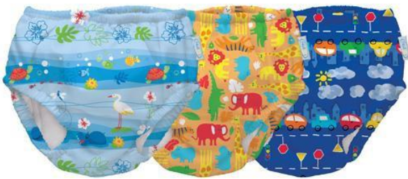
Approved Swim Diaper

Thank you for your cooperation with the enforcement of this policy and keeping our facility safe for all visitors and staff. Should you have any questions regarding these policies, please see the Pool Manager, or you may contact the Ganek Municipal Center by calling (847) 658-2716 or emailing recreation@algonquin.org .