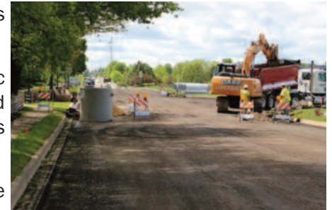
Work on Sleepy Hollow Road will occur over two phases with the overall completion date expected in November

Drivers in this project area should be prepared to reduce their speed, exercise caution, watch for construction workers and construction vehicles entering or leaving the site, and obey flaggers and other traffic control devices within the work zone. For project details, please visit www.algonquin.org/construction .