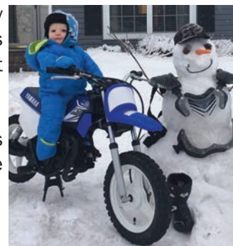
2018 Snowman Photo Contest Winner

For more information or to browse and register for recreation programs, please visit www.algonquin.org/recreation .