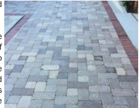
An ashlar brick pattern defines the expanded pedestrian areas in Old Town Algonquin

This fall visible work began with the placement of new ashlar brick pavers along the sidewalks on Main Street. These pavers have created an inviting walkway in front of businesses and in the parking lanes. The west side of Main Street was also redesigned to create more pedestrian space and visible crossing areas. These elements will create a more pedestrian friendly environment that improves safety and creates a sense of community with places for people to gather. Not to be forgotten is the new concrete road and brick paved parking stalls on Main Street that provide travelers with a smooth drive and ideal parking experience.