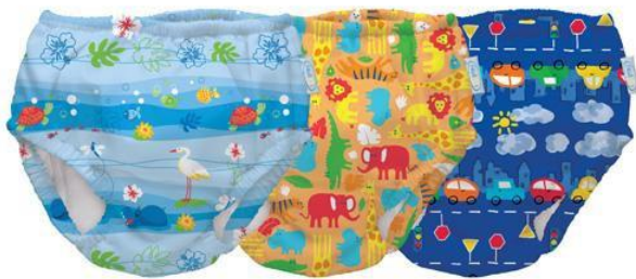
Approved Swim Diaper

Thank you for your cooperation with the enforcement of this policy and keeping our facility safe for all visitors and staff. Should you have any questions regarding these policies, please see the Pool Manager, or you may contact the Ganek Municipal Center by calling (847) 658-2716 or emailing recreation@algonquin.org .