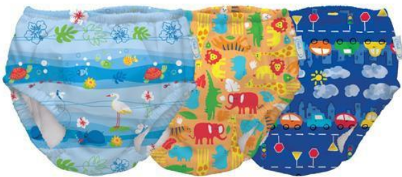
Approved Swim Diaper

Thank you for your cooperation with the enforcement of this policy and keeping our facility safe for all visitors and staff. Should you have any questions regarding these policies, please see the Pool Manager, or you may contact the Ganek Municipal Center by calling (847) 658-2716 or emailing recreation@algonquin.org .