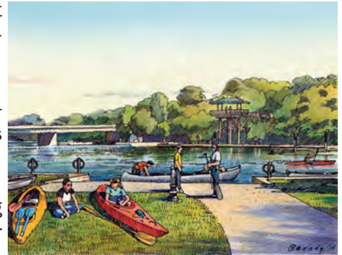
Artist rendering of potential recreational uses along the Fox River in Algonquin

The final plan document is providing a range of recommendations for increasing waterway recreation and complimentary land uses, which will be considered for implementation moving forward. For more information or to download a copy of the plan, please visit www.algonquin.org/development .