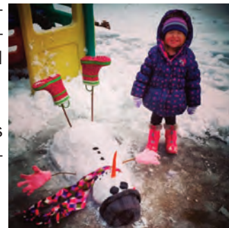
2015 Snowman Photo Contest Winner

For more information or to browse and register for recreation programs, please visit www.algonquin.org/recreation .