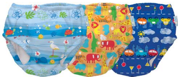
Approved Swim Diaper

Thank you for your cooperation with the enforcement of these guidelines and keeping our facility safe for all visitors and staff. Should you have any questions regarding these policies, please see the Pool Manager, or you may contact the Village Hall by calling (847) 658-2700 or email recreation@algonquin.org .