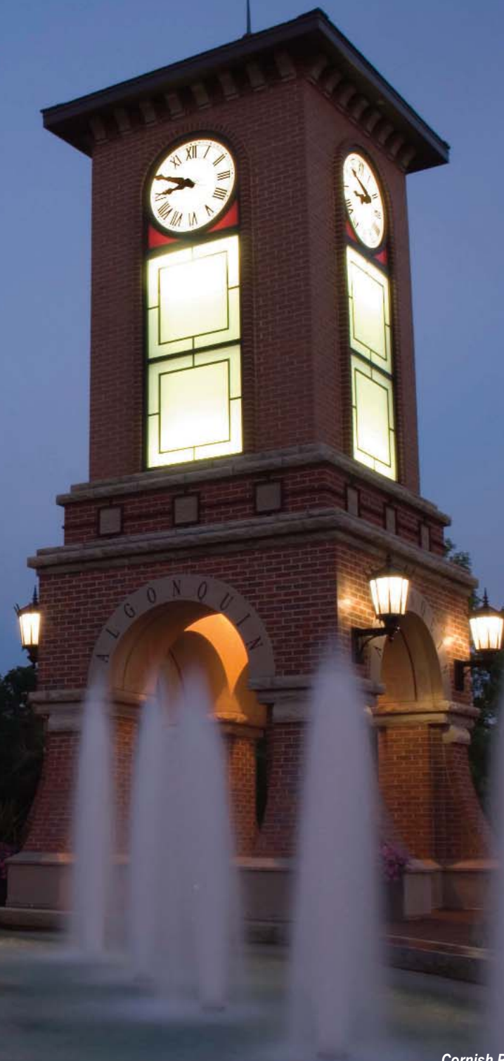
Cornish Park Clock Tower

Providing the public with the best possible methods of communication and transparency is a top priority for the Village. Utilizing the aforementioned technology and services help achieve this goal in a cost-effective manner. Check out www.algonquin.org for more information!