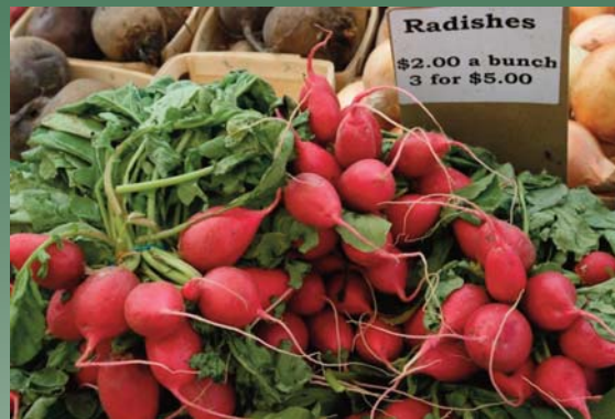
Downtown Algonquin Farmers Market (Left)

Fresh produce and other items can be found at the Downtown Algonquin Farmers Market. The market runs Thursdays throughout the summer.