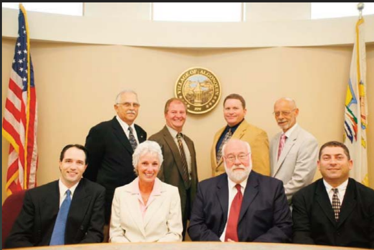
Village President and Board of Trustees