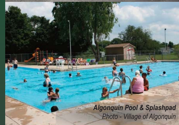
Algonquin Pool & Splashpad Photo - Village of Algonquin