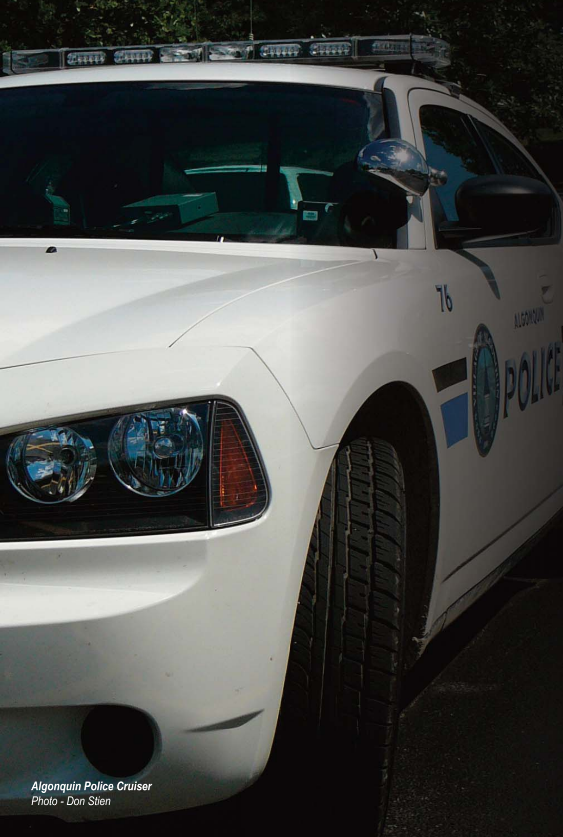
Algonquin Police Cruiser