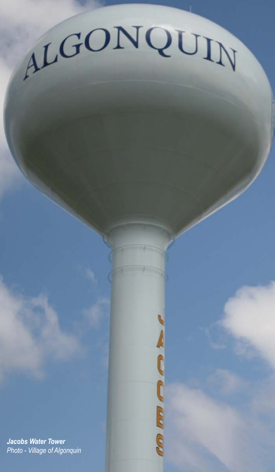
Jacobs Water Tower