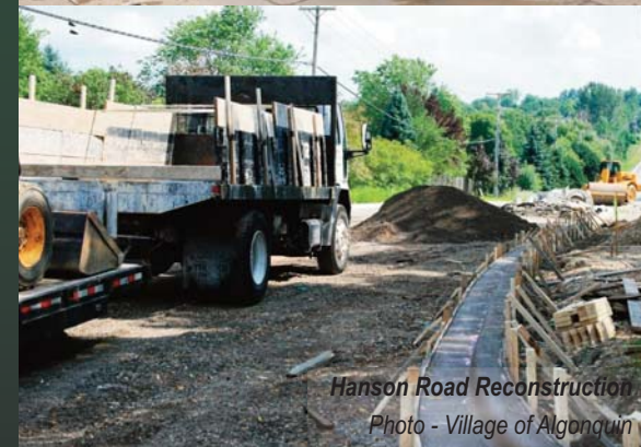
Hanson Road Reconstruction Photo - Village of Algonquin