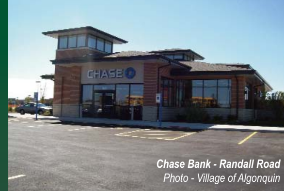
Chase Bank - Randall Road

You will find more details about the Village’s services and accomplishments on the pages of this calendar. We hope you find the 2011 Annual Report and Calendar useful during the year and wish you a safe, healthy, and prosperous 2011!