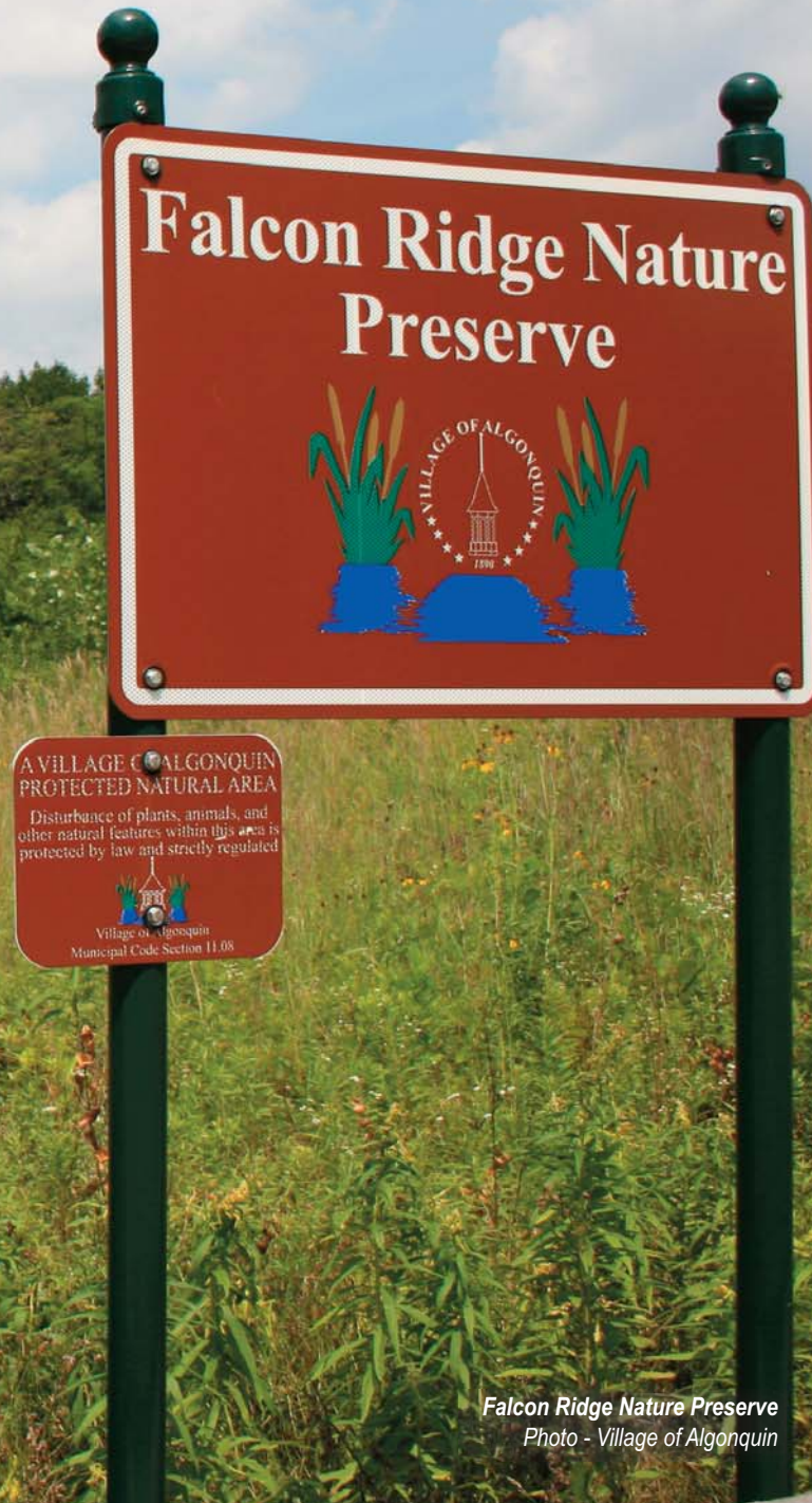
Falcon Ridge Nature Preserve Photo - Village of Algonquin

For more information on stormwater, please visit www.algonquin.org/publicworks .