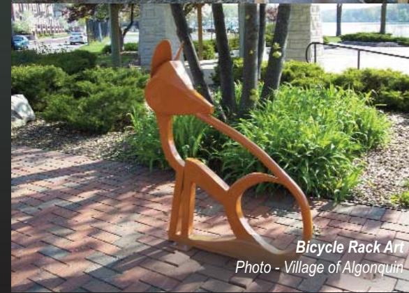
Bicycle Rack Art Photo - Village of Algonquin