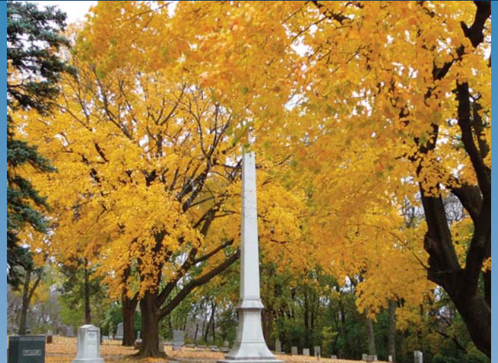
Residents learned about local history and enjoyed fall colors during the Algonquin Cemetery Walk.

During the October Algonquin Cemetery Walk, hundreds of residents toured the Cemetery to see and hear about people from the last two centuries who made our town what it is today. Fortunately, you don't have to wait until next October to find out about the history of your town. The Historic Commission holds workshops every third and fourth Saturday morning (8:30am – 12:00pm) on the second floor of Historic Village Hall (2 S. Main St.) These workshop meetings are open to the public. You might have questions about the history of your house, need help with architectural elements, have a need for family information, or you may have come across artifacts or photos of Algonquin past that you want to identify. Even if you are just plain curious about area history or whatever the reason, you are welcome at the workshop meetings!