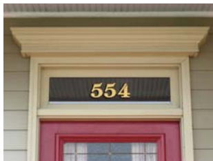
House Numbers should be at least 4" in height

Village inspectors routinely identify homes that are without the proper house identification numbers. Village Code requires that all properties be identified with numbers that are attached to the front of the building, visible from the street or roadway, of no less than 4 inches in height. The numbers shall contrast with their background. Numbers only on mailboxes do not meet code requirements as many areas of town have mailboxes set in groups. Please remember that this is for the safety of you and your family in emergency situations should the a fire district or Algonquin Police Department have the need to identify your property promptly. Please contact the Community Development Department at 847-658-4184 with any questions.