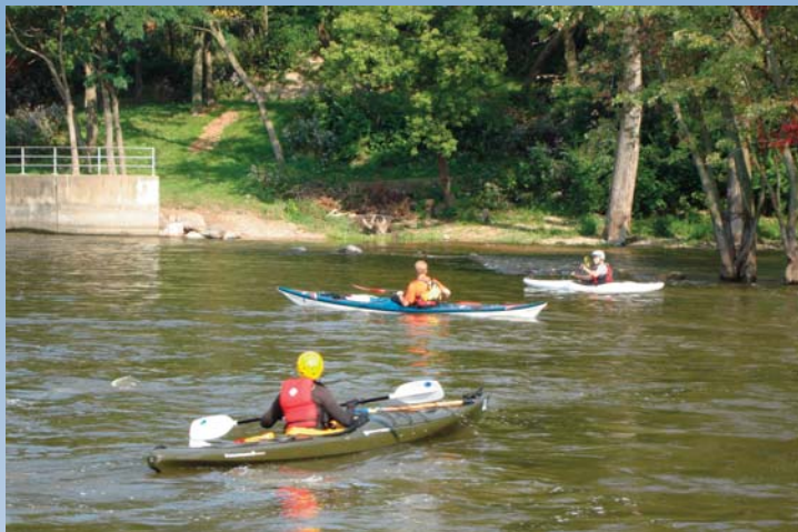
Prairie Coast Paddler Kayakers demonstrate on the Fox River at "It's Our River Day"