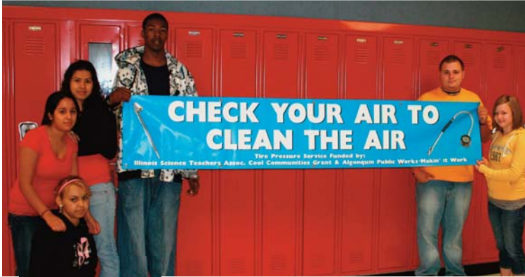
District 300 students learn the benefits of properly inflated tires

The Village of Algonquin's environmental efforts have recently been presented at two important area events. The Village participated in the Illinois Municipal League Conference in Chicago in late September. The Village featured a collaboration with environmental science teacher Gary Swick and students from District 300 on the "Check Your Air for Clean Air" program. The program provides students with classroom education coupled with real-world applications from the Village to approach the practical challenges of fuel efficiency and implement projects to reduce carbon emissions.