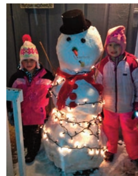
2013 Snowman Photo Contest Winner

For more information or to browse and register for recreation programs, please visit www.algonquin.org/recreation .