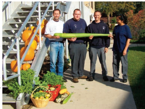
Algonquin Water and Sewer Utility employees with the fall's harvest of vegetables

The initial vegetable garden design and construction were guided under the direction of pantry volunteer Laurie Selpien. To date, nearly 2,000 pounds of vegetables grown at the Algonquin Wastewater Treatment Facility have been donated to the Algonquin-Lake in the Hills Interfaith Food Pantry, with an estimated value of $3,000.