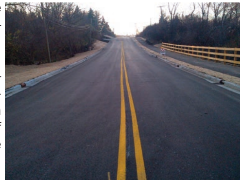
Edgewood Drive was fully reconstructed in 2012 and features a new pedestrian trail.

Copenhaver Construction of Gilberts, IL was awarded the project for approximately $3 million. Federal funding was awarded for this project through the surface transportation program, including a contribution from the Congestion Mitigation and Air Quality (CMAQ) Improvement Program for the construction of a multi-use path on the north side of Edgewood Drive. Funding from these sources comprised of two-thirds of the total project cost.