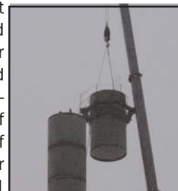
On an overcast day in January, a crane is seen hoisting pieces of the new water tower.

treat and pump nearly 3 million gallons of water per day. The plant's design is a new way of treating well water that uses membranes to filter the water instead of the conventional sand media. This membrane filtration plant is the first of its kind and one of only a dozen or so similar plants currently being built in the country. The plant will start operations in mid-summer, and will be the host site for an American Water Works Association conference next year.