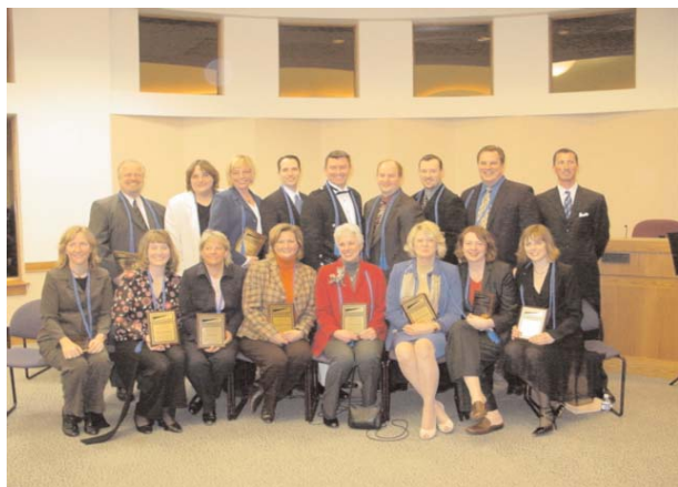
Graduates of the Ted Spella Leadership School pose at their graduation in February.