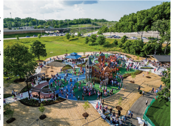
Families celebrated the grand opening of Algonquin's new Towne Park playground - an exciting community space for all to enjoy.

For more information, please visit www.algonquin.org/recreation .