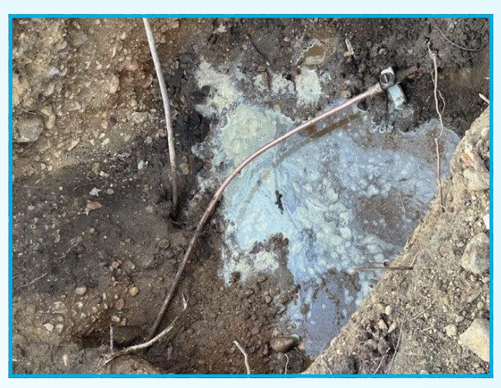
Replacing Lead Service Line With Copper Service Line

In 2018, the Village of Algonquin initiated a proactive effort to improve the safety and quality of its drinking water system by beginning the removal of lead service lines. This project is part of the Village's long-term infrastructure improvement strategy and its commitment to public health. As of today, a total of 146 lead service lines have been successfully removed from the water system. This ongoing effort continues to enhance water safety for residents and supports compliance with state and federal guidelines regarding lead in drinking water.