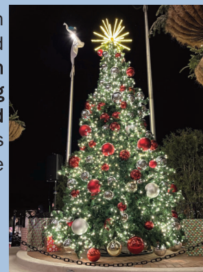
Miracle on Main Event in Old Town Algonquin

Happy Holidays from the Village of Algonquin!