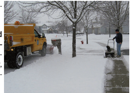
An Algonquin snow plow clearing a residential street during a winter storm.