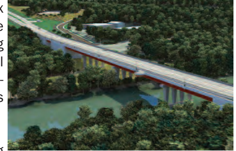
All stages of Longmeadow Parkway from Huntley Road to Algonquin Road are expected to be complete by 2019.

Kane County has started construction on Longmeadow Parkway between Huntley/Boyer Road and Randall Road. Work on this section is anticipated to be complete by fall 2016. Work will involve clearing and shaping the existing area for the construction of a new roadway and traffic signal. The Longmeadow Parkway Fox River Bridge Corridor is a planned, tree-lined parkway and Fox River bridge crossing with a landscaped median, approximately 5.6 miles in length, running from Huntley Road to IL Route 62. When complete, Longmeadow Parkway will provide a valuable benefit to the public by relieving congestion, encouraging economic development in the region, improving travel options, and connecting towns and neighborhoods.